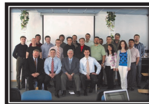
Seminar Participants at Baptist Seminary in Moscow

Also on this journey, I had consultations in England and travelled to Switzerland to discuss the possibility of translating my book into French. [A German translation is in the beginning stages as well.] With all these enriching experiences, I thank God for the privilege that WMA has as we serve in other parts of the world.